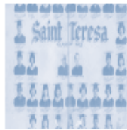
125 Years of History

St. Teresa of Avila Parish is proud to announce the 2018 Virtual Ministry Fair. The fair is a wonderful way to support worthy organizations working to make a difference in Chicago and beyond. The fair winners are: CHICAGO JESUIT ACADEMY, DOMINICAN UNIVERSITY, LA MAIN DEVINE, ST. AGATHA, THE DOVETAIL PROJECT, and VOCEL.