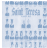
125 Years of History St. Teresa of Avila parish is proud to announce the 125th anniversary of the parish. The parish has a rich history of service and ministry to the community. The anniversary is a wonderful opportunity to reflect on the parish's past and look forward to the future.