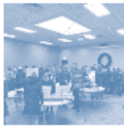
Virtual Ministry Fair St. Teresa of Avila parish is proud to announce the 2018 Virtual Ministry Fair. The fair is a wonderful way to support worthy organizations working to make a difference in Chicago and beyond. The fair winners are CHICAGO JESUIT ACADEMY, DOMINICAN UNIVERSITY, LA MAIN DEVINE, ST. AGATHA, THE DOVETAIL PROJECT, and VOCEL.