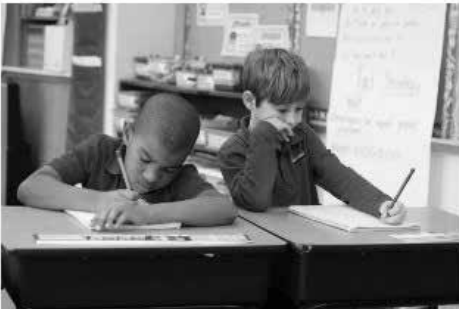
OUR MATH AND READING TEST SCORES ARE MUCH HIGHER THAN THE NEIGHBORING SCHOOLS.