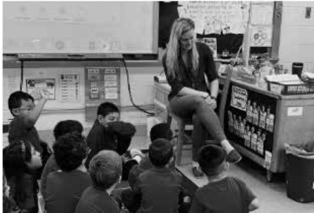
SMALLER CLASS SIZE SUPPORTS STUDENT CENTERED LEARNING OPPORTUNITIES