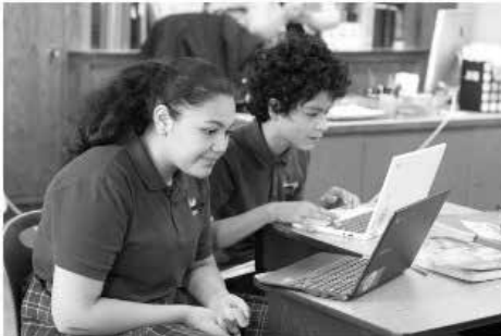
WE PROVIDE A 1:1 CHROMEBOOK PROGRAM FOR MIDDLE SCHOOL STUDENTS.