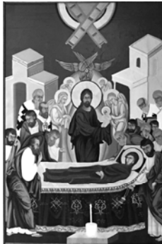
The Dormition of Mary Icon at St. Teresa of Avila Church

On November 1, 1950, Pope Pius XII, exercising papal infallibility and declared that it is a dogma of the Church "that the Immaculate Mother of God, the ever Virgin Mary, having completed the course of her earthly life, was assumed body and soul into heavenly glory."