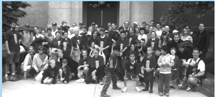
The 2013 St. Teresa Hunger Walk Team that earned more than $9,000 in food credits with the Greater Chicago Food Depository!