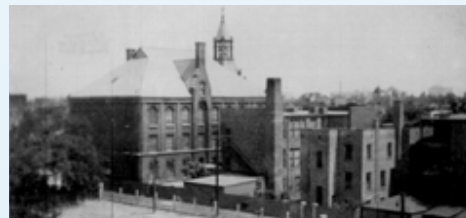
The St. Teresa of Avila campus (church, school and convent) prior to the 1959 Easter fire.

Our nearing parish anniversary pairs with the 500th anniversary of the birth of St. Teresa of Avila. A book is being planned to commemorate both events. Can you help? We will be asking for: