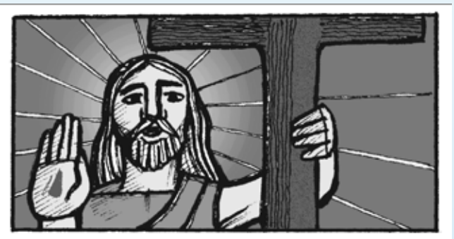
C. J. S. Paluch Co., Inc.

fue una de las primeras imágenes de Cristo en la Iglesia de los apóstoles. El pasaje de hoy continúa el tema más sombrío de las dos primeras lecturas. El peligro acecha y las ovejas necesitan protección. Podrían seguir un guía falso, podrían ser robadas o destruidas. Sólo con Jesús estarán a salvo. Sólo con Jesús lograremos la vida eterna. Copyright © J. S. Paluch Co.