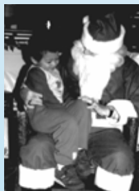
Breakfast with Santa at St. Teresa from 30 years ago...

This event is sponsored by the St. Teresa's Men's Spirituality Group.