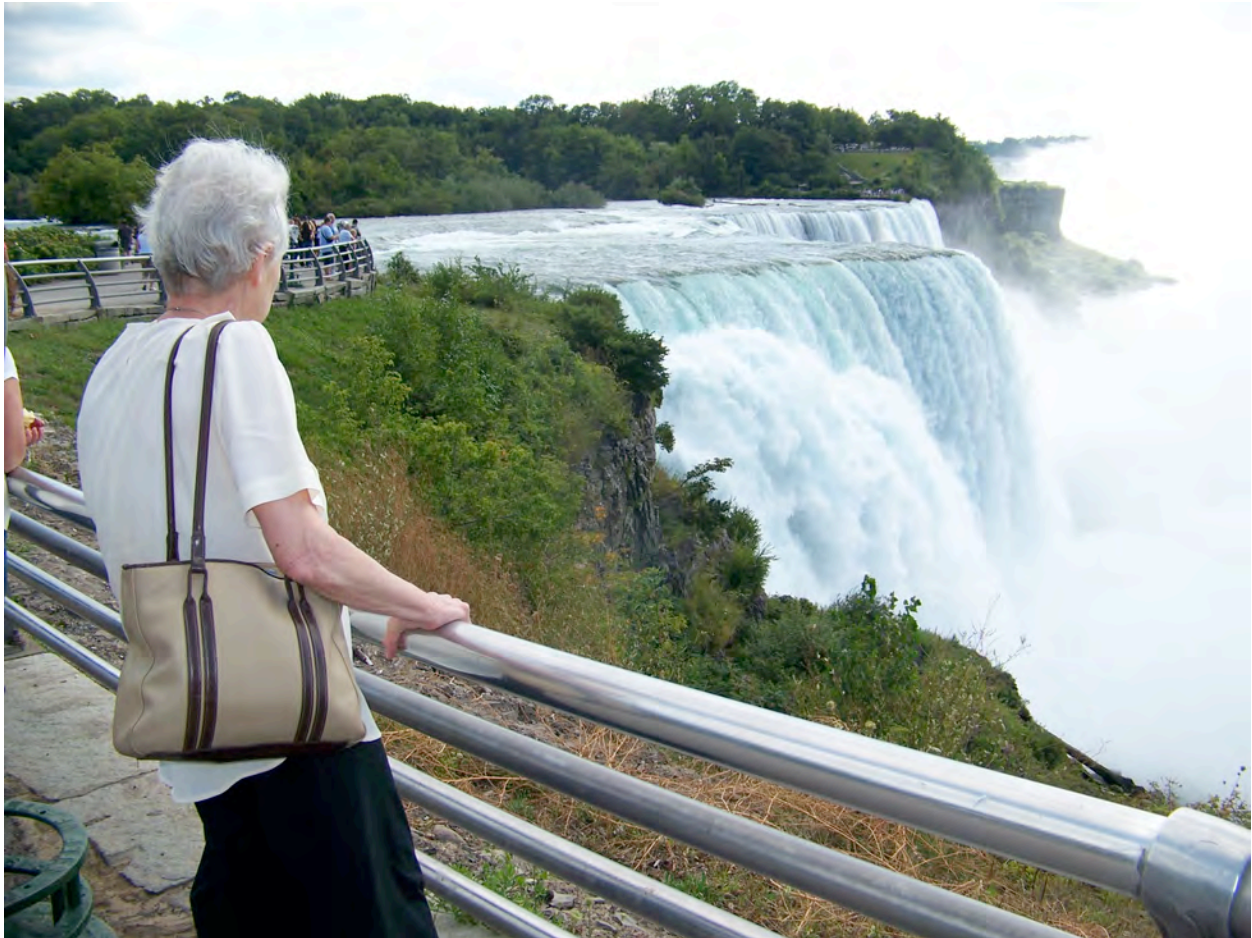
Niagara Falls, 2009